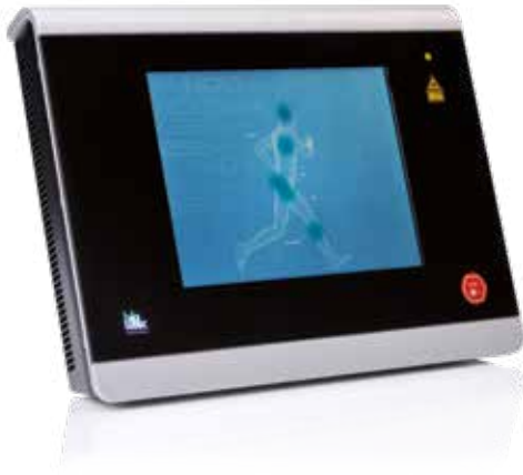
LEONARDO® DUAL 45 universal & ingenious