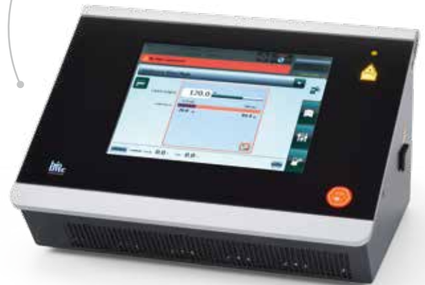
LEONARDO® DUAL 200 versatile & powerful