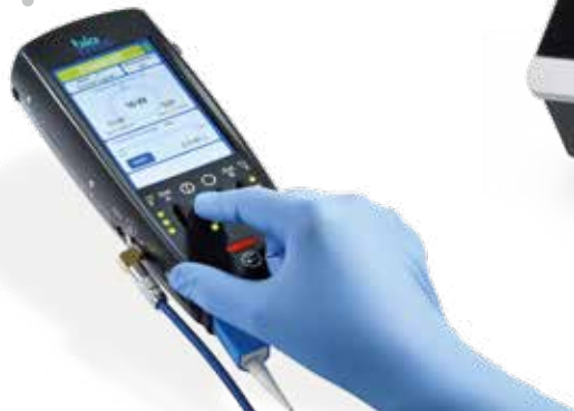
LEONARDO® Mini basic & specialist